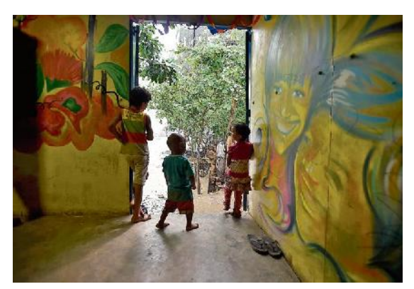
Children at a night shelter. Activists say a child goes missing in India every eight minutes

For the past two years, Gurgaon police have been earning plaudits for rescuing a record number of "missing" children and rehabilitating them, saving them from a harrowing life of exploitation and abuse.