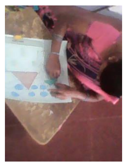
Students participating in the Skill Development Programme