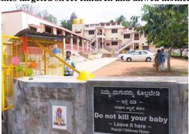
End of ordeal: The Bapuji Children's Home where the rescued children have been housed.

Private maternity homes targeted street children and unwed mothers